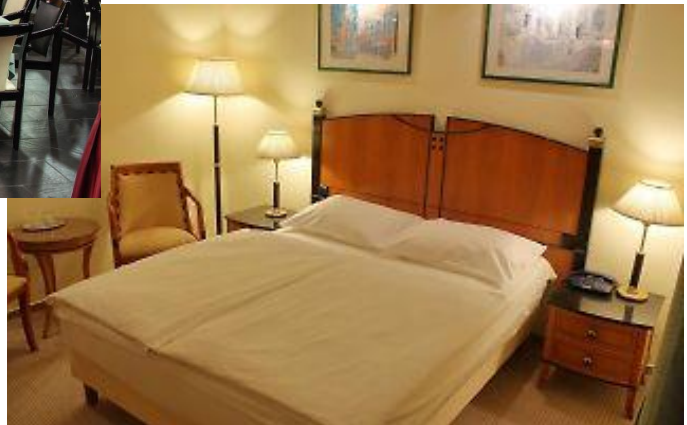
Hotel Centrál Nagykanizsa

Meals are available 3 times a day. First meal (dinner) served at arrival day on 28 th August. Last meal (breakfast) served on 4 th September.