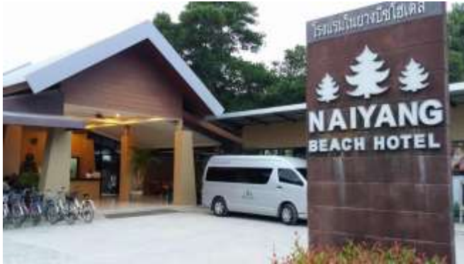
NAIYANG BEACH HOTEL