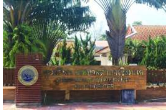
CHERNGTALAY SWIMMING POOL

Cherngtalay indoor swimming pool is 25 m. 8 lanes, near to Phuket Laguna Resort complex and diagonally opposite the Bake Cherg Talay.