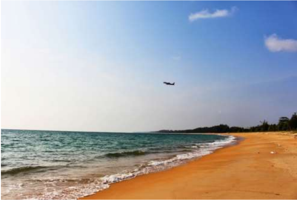
Sirinath National Park