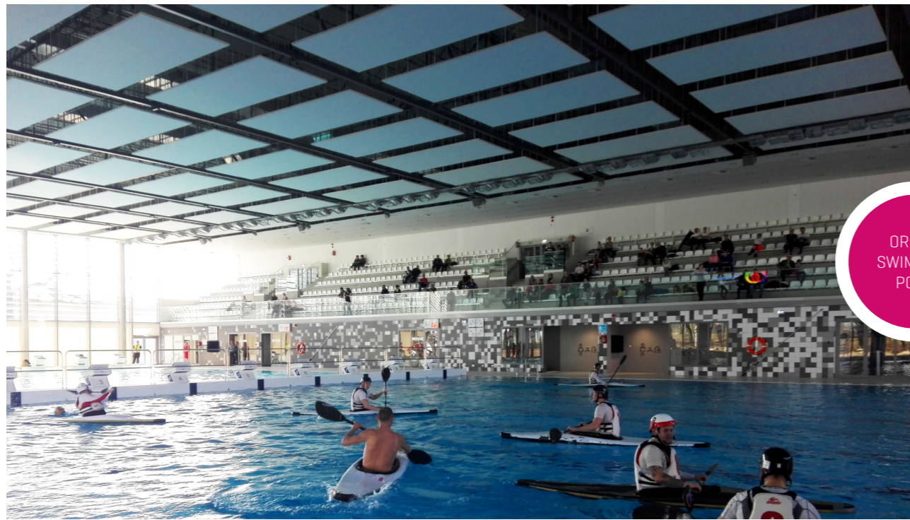
ORBITA SWIMMING POOL