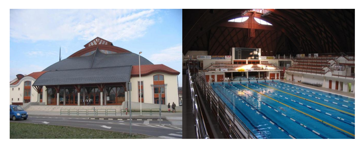
Address: H-3300 Eger, Frank Tivadar u. 5.- Hungary

The swimming pool has a length of 50m., a width of 8 lanes, depth of 2m, electronic scoreboard and about 1500 spectator's seats. The temperature of the water is 26 \,^{\circ}\text{C} + 1 \,^{\circ}\text{C} .