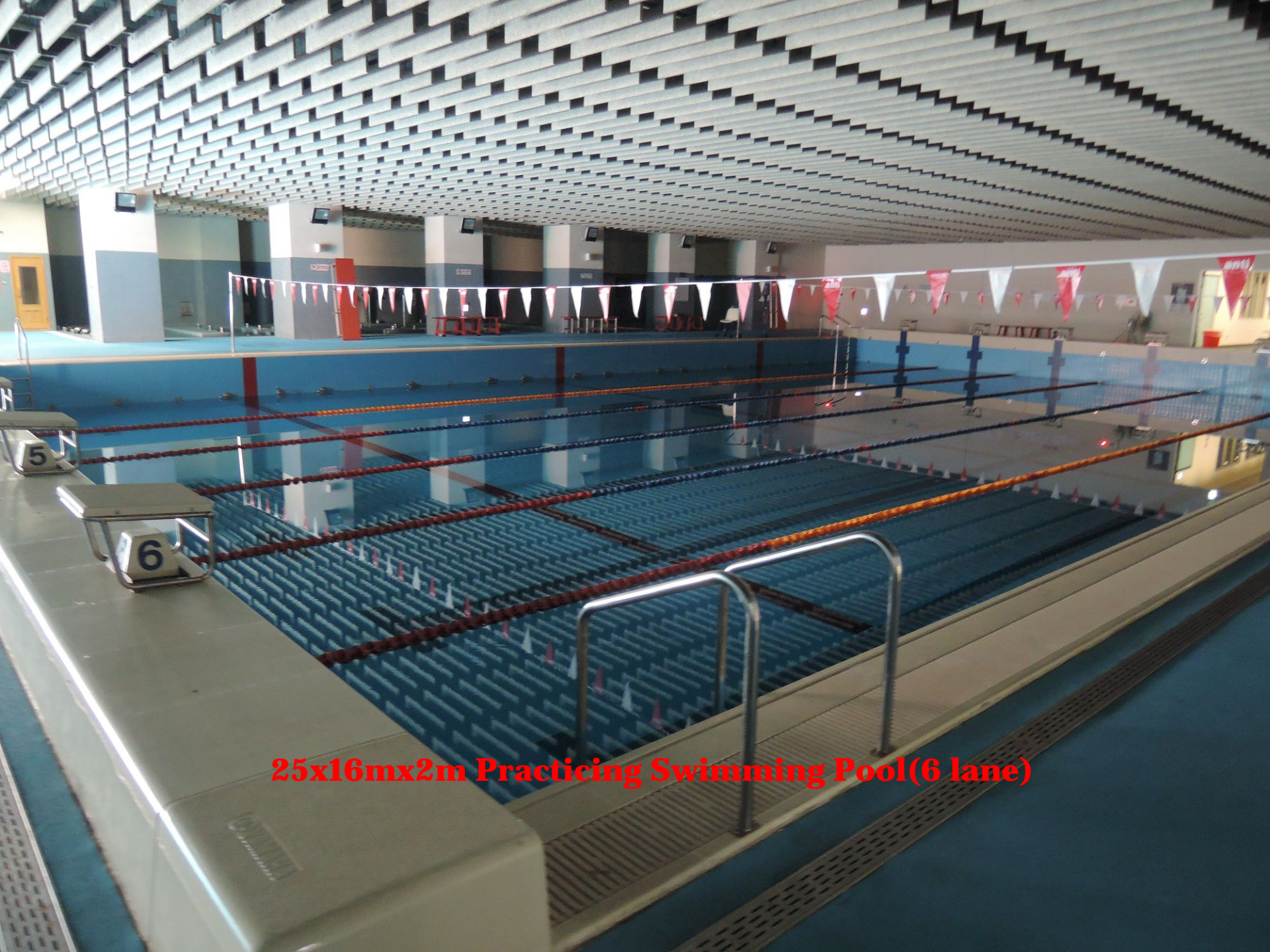
25x16mx2m Practicing Swimming Pool(6 lane)