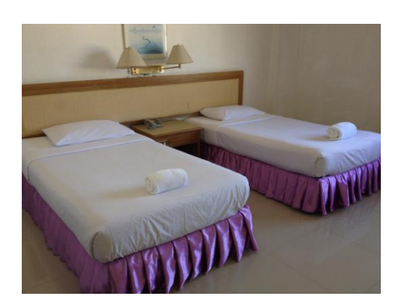
PHUKET GARDEN HOTEL

Transportation From Hotel to Swimming pool will take abound 15 min.