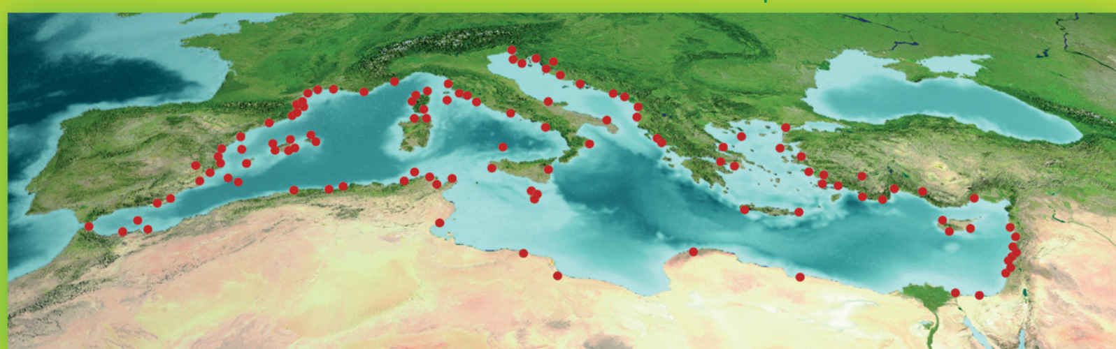
Mediterranean Marine and Coastal Protected Areas

156 protected areas are, currently, declared in the Mediterranean coastal area by the riparian countries.