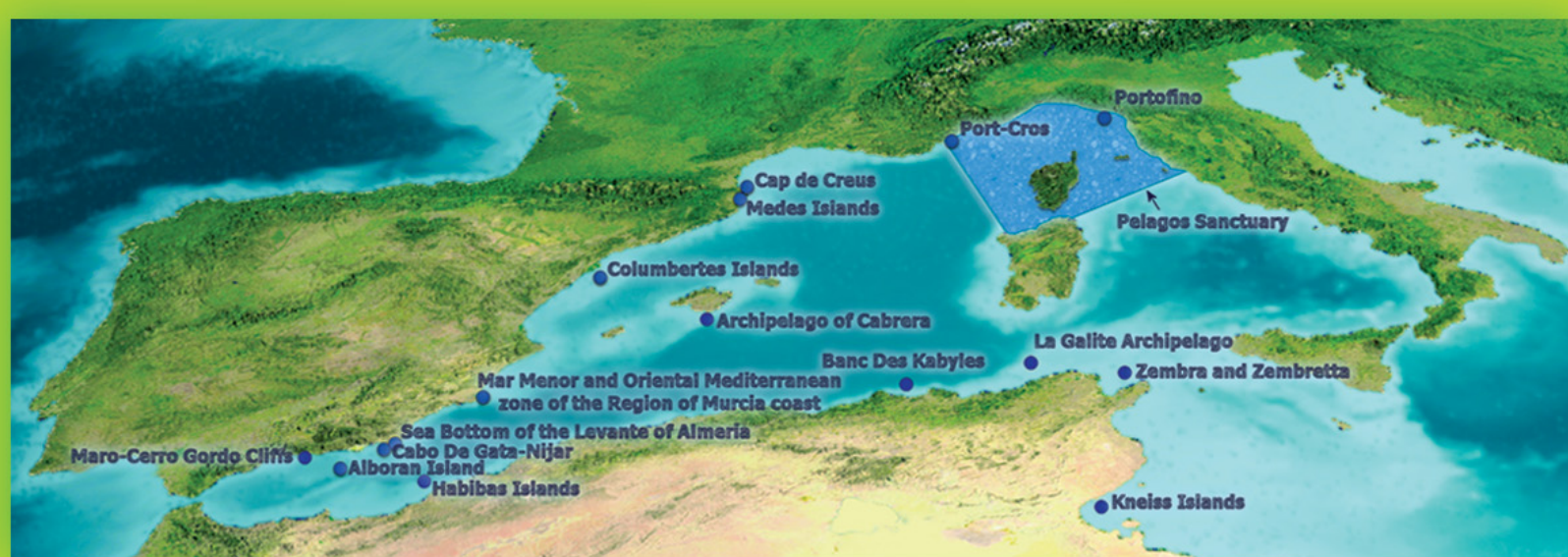
SPAMIs list (2005)